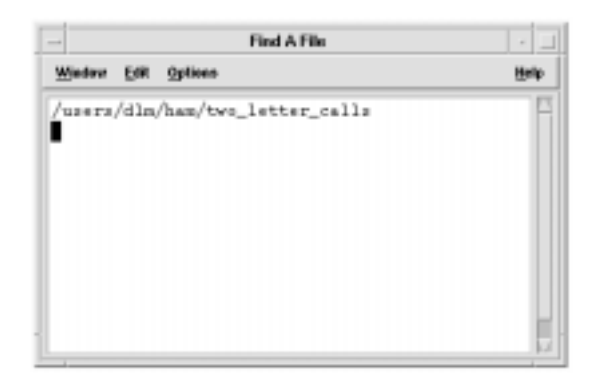
Figure 4-3 Window showing complete path

When you correct the mistake, script_find then executes properly and creates a dtterm window within which it displays the complete path of the file you requested, providing that the file is found.